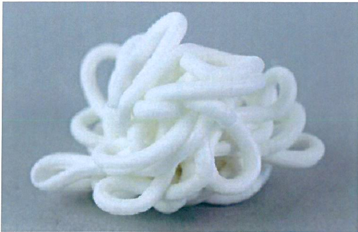
Above: Faster purging is a key customer demand, according to Shuman Plastics, Dyna-Purge Division