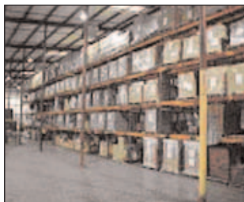
Reductions in Freight Costs

region, we opened our new distribution warehouse at TriStar Logistics in Goodlettsville, TN, about 15 miles north of Nashville.